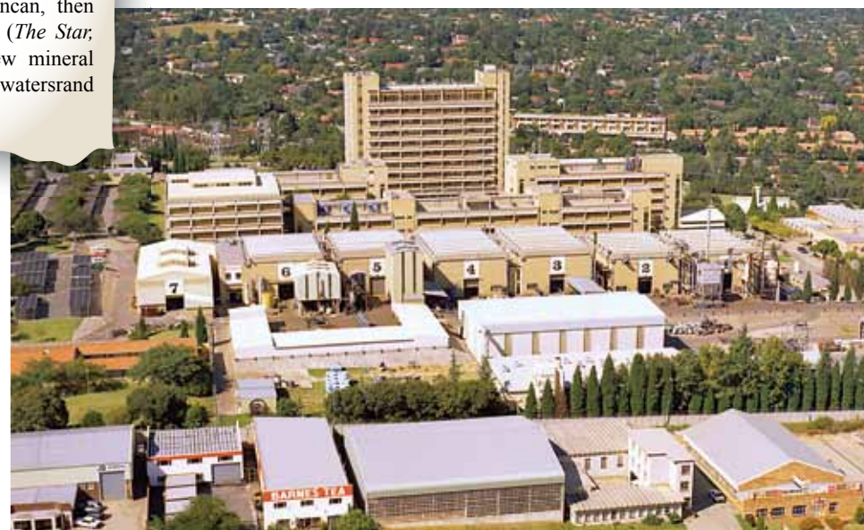
An aerial view of Mintek in 2009.

Speech made by Mr Patrick Duncan, then South Africa’s Minister of Mines ( The Star , 1934), at the opening of the new mineral research laboratory at the Witwatersrand University.